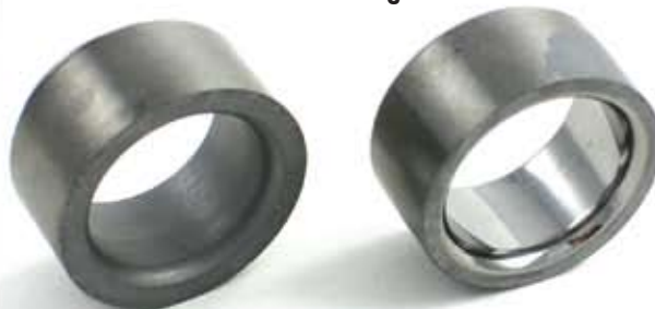
Before Diamond Flex-Hone